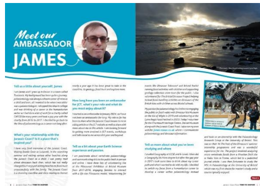
Interview feature in Jurassic Coast Trust Time to Inspire Magazine.